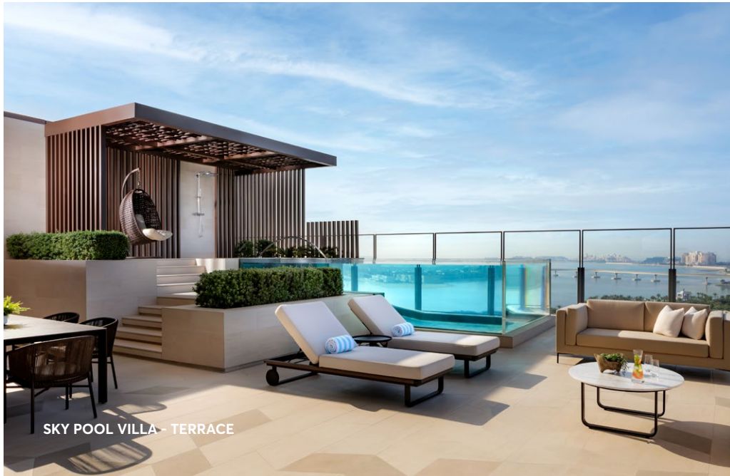
SKY POOL VILLA - TERRACE